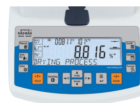
Large LCD screen with text information line